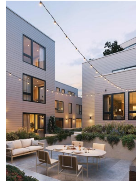
22 The Amenities