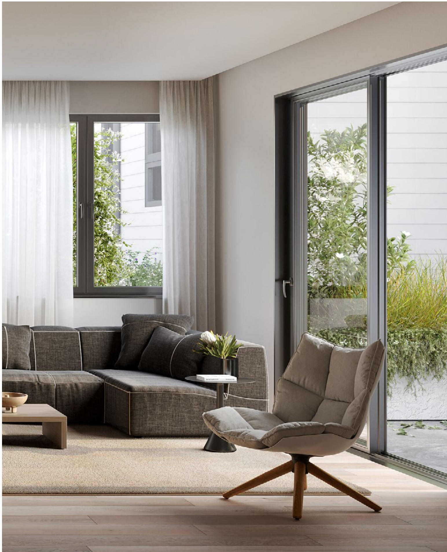
Spaces that extend your living