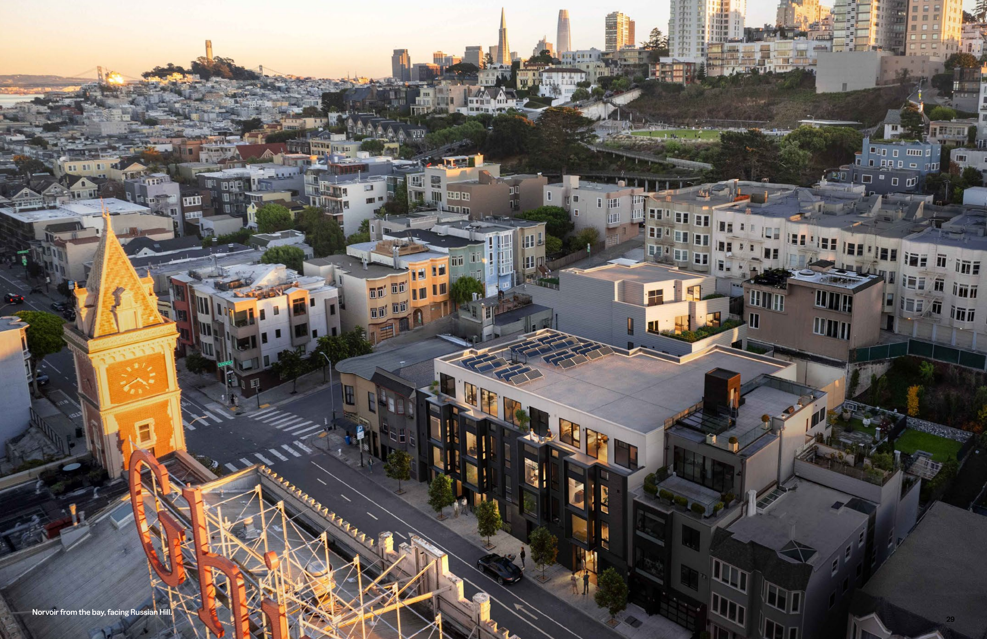
Norvoir from the bay, facing Russian Hill.