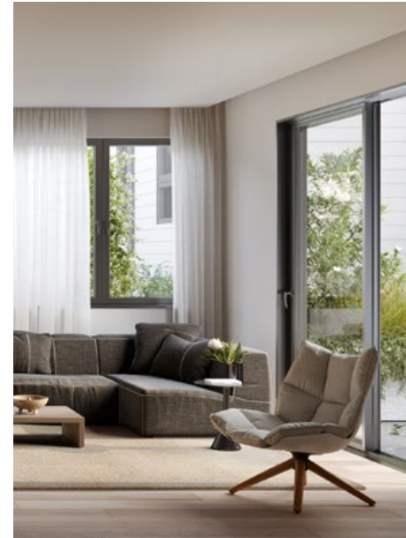
13 The Residences