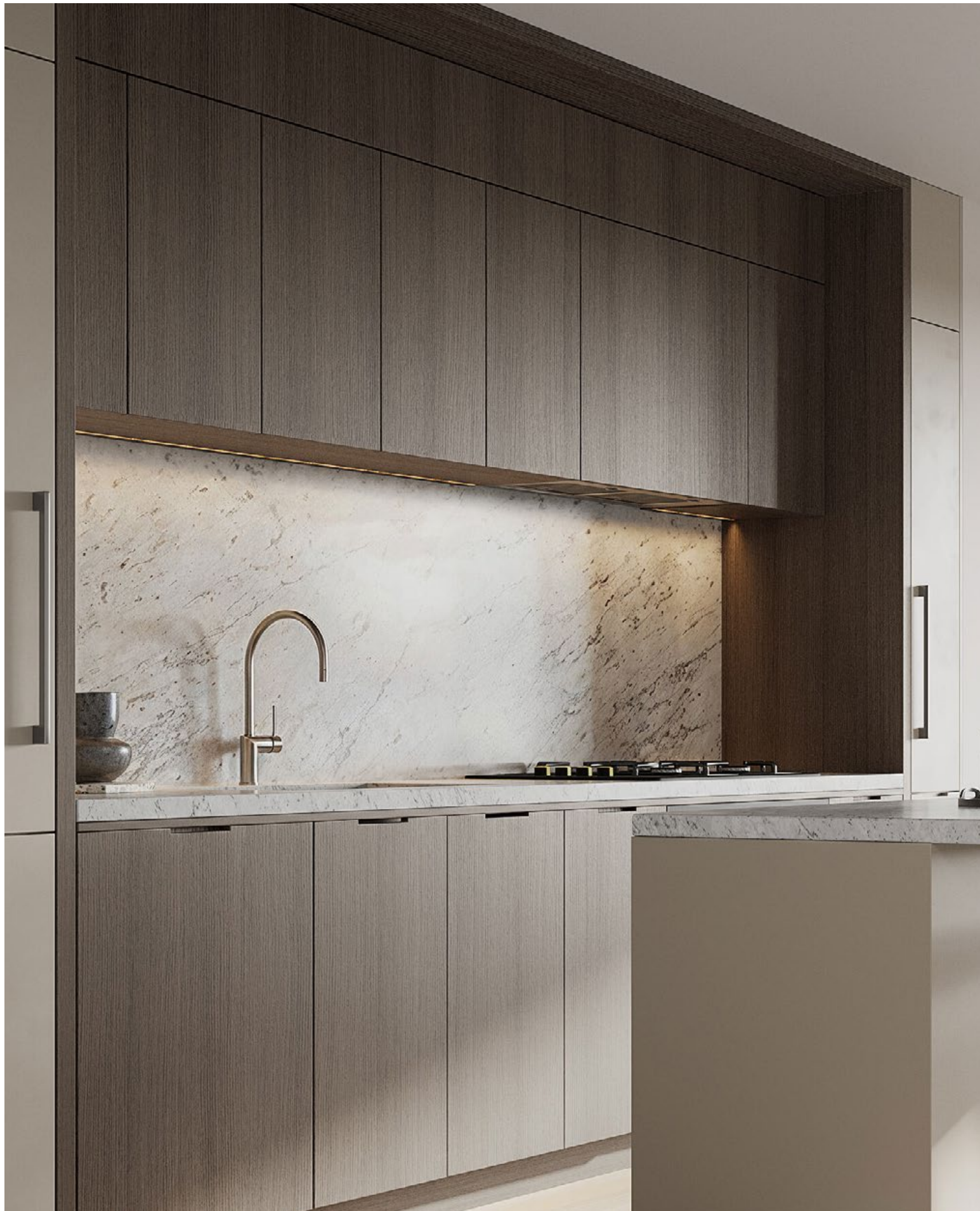
Designed to serve your palette